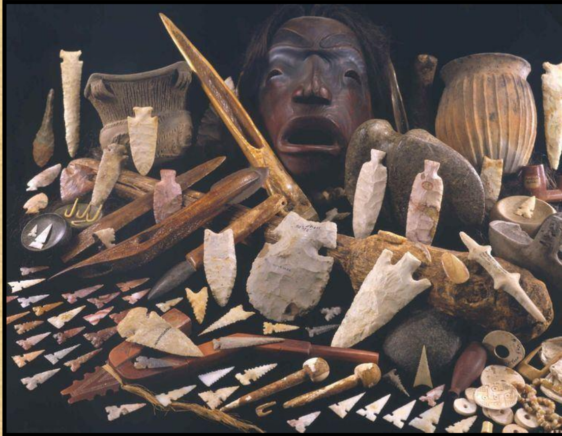
TOOLS AND OTHER ITEMS FROM THE PALEOLITHIC AGE