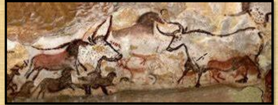
PALEOLITHIC ART